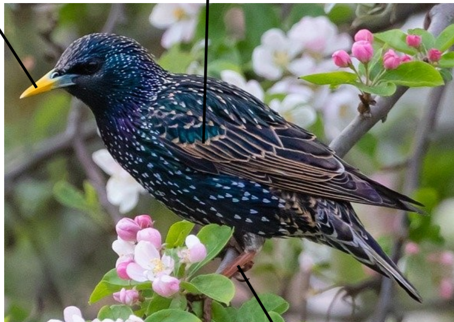
Long, strong, red brown legs