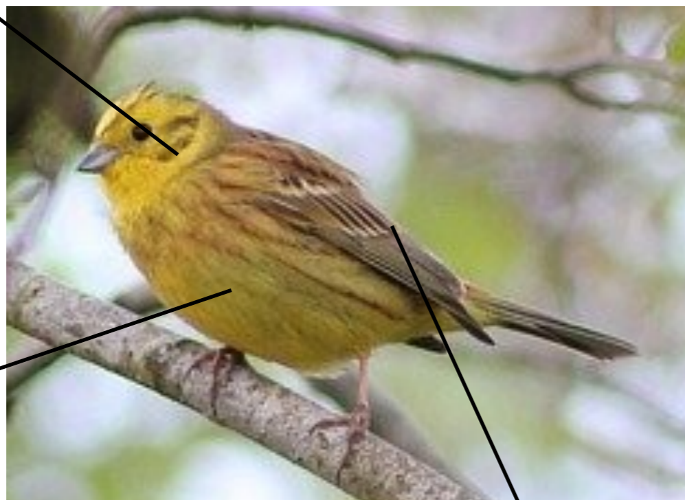
Yellow below with fine dark streaks