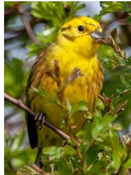
Yellow head with dusky stripes