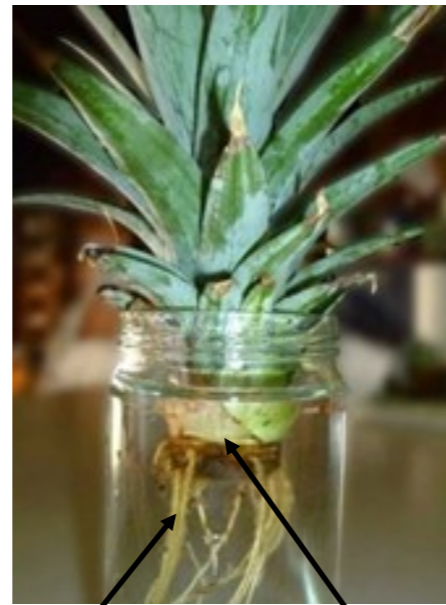
Fibrous roots Basal stem