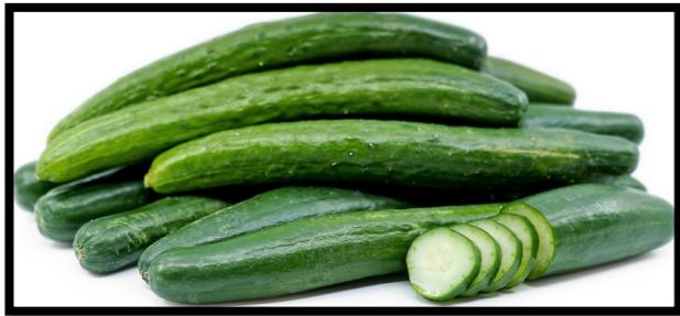
Kyuri, or Japanese cucumbers

Kyuri, or Japanese cucumbers, are slim, dark green with small bumps and thin skins. They are crisp and sweet with tiny seeds. Japanese cucumbers are also “burpless” varieties