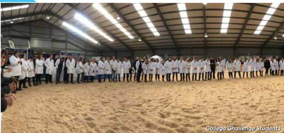
College Challenge Students

More information on The C. Alma Baker Trust, its history, and farming operations at Limestone Downs, please visit their website www.calmabakertrust.org/