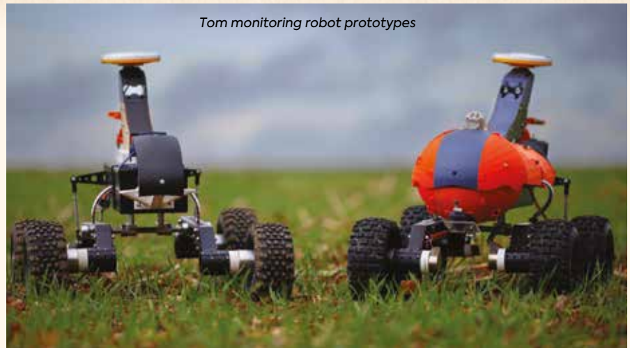
Tom monitoring robot prototypes

This calls the big machinery model into question. This model is simply not working. Unfortunately, if you treat the whole field the same, waste